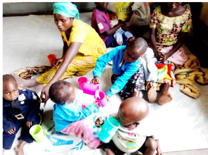
Baby orphans receiving care from HEM's office in Kyaka II Settlement.