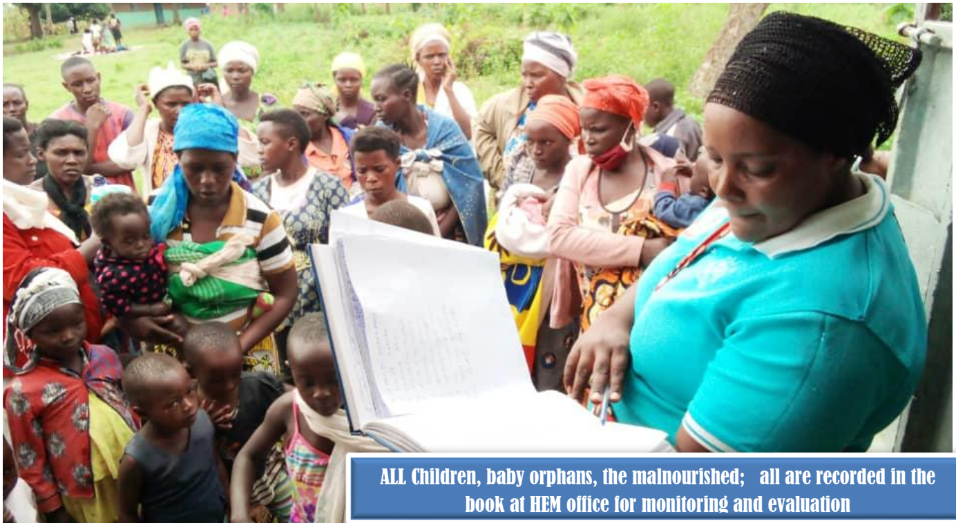
ALL Children, baby orphans, the malnourished; all are recorded in the book at HEM office for monitoring and evaluation