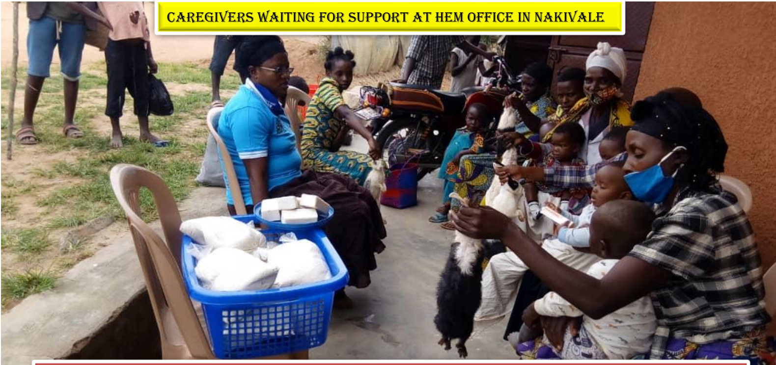
Babies orphans, children (orphans) receiving milk powder and Rabbits for future income