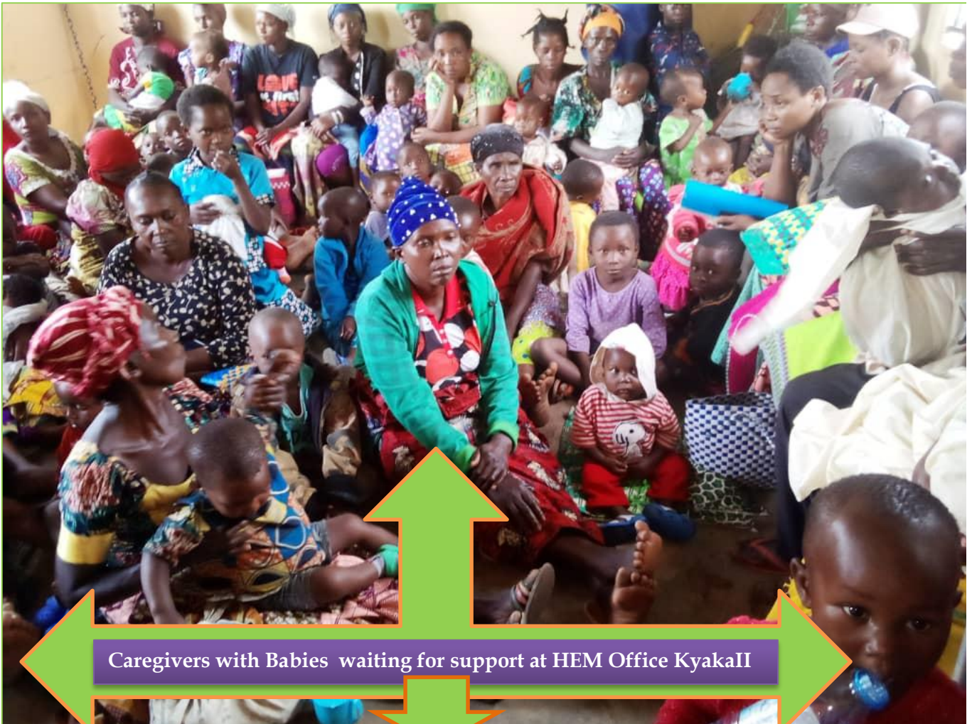
Caregivers with Babies waiting for support at HEM Office KyakaII